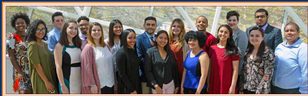
2017 Orientation Staff